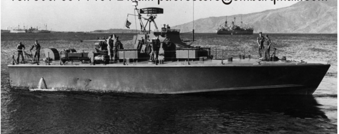
PTF 3 at Subic Bay, Phillipines in 1963 prior to deploying to VietNam.

Tel: 800/ 694-7161 E mail: ptf3restore@embarqmail.com